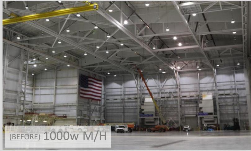
(BEFORE) 1000w M/H

SAVE UP TO 80% IN ENERGY COSTS WITH OptimalLED™