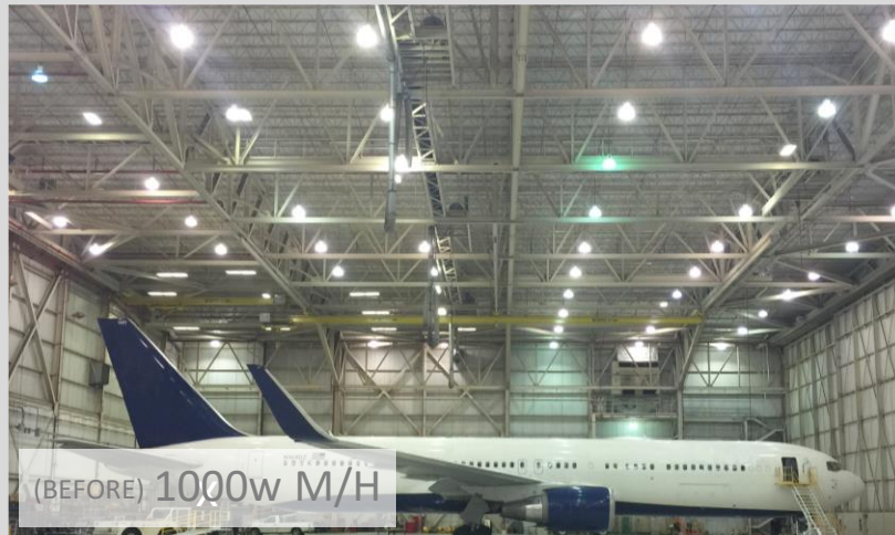
(BEFORE) 1000w M/H