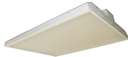
LED Linear High Bay (165w shown) Enclosed power supply and covered optics High efficiency lumen output, 130 lm/W Suitable for damp locations

High quality LEDs at factory direct prices.